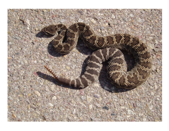
BACKCOUNTRY HORSEMEN OF CALIFORNIA